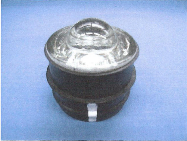
Siglite Kerb-Stud D50 in white